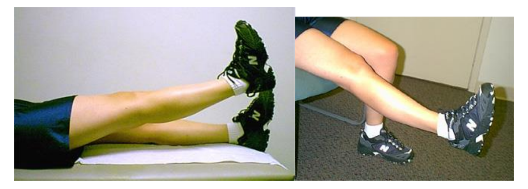
Figure 9. Straight leg raises – lying (left) and seated (right)

This exercise can be performed out of the brace when the leg can be held straight without sagging (quad lag). Once you have gained strength, straight leg exercises can be performed while seated. See Figure 9