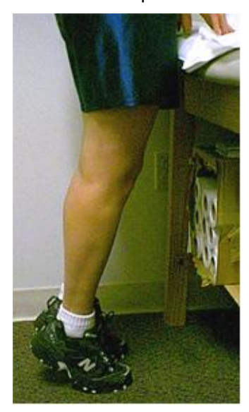
Figure 11. Toe Raise