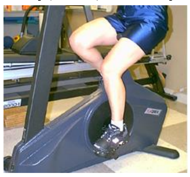
Figure 6. Stationary Bicycle helps to increase strength

1) Stationary Bicycle. Use a stationary bicycle two times a day for 10 - 20 minutes to help increase muscular strength, endurance, and maintain range of motion. See Figure 6