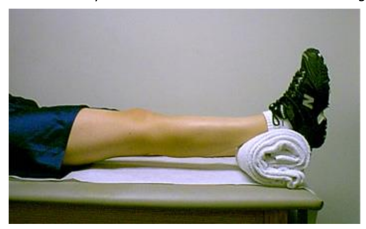
Figure 1. Heel prop using a rolled towel.