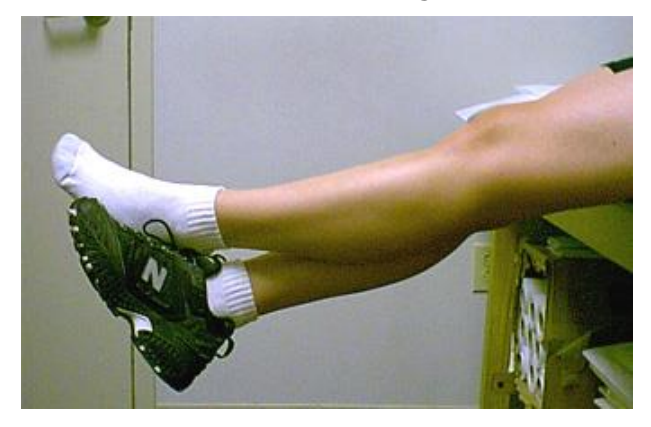
Figure 7. Use the non-injured leg to straighten the knee

2) Active-assisted extension is performed by using the opposite leg and your quadriceps muscles to straighten the knee from the 90 degree position to 0 degrees. Hyperextension should be avoided during this exercise. See Figure 7: